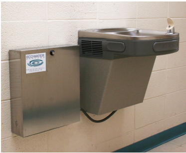
Drinking Water Fountain